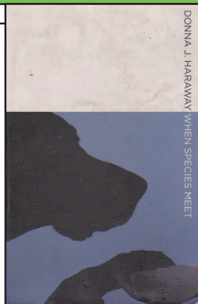
DONNA J. HARAWAY WHEN SPECIES MEET

The Art & Literature section is by far the smallest. Maybe it's just that I've been sucked into this non-fiction world for a year or two now, but I haven't found a massive amount of work I deemed relevant in this way (although I'm hoping to add a children's section which would be very rich I think, having grown up with Beatrix Potter and Hugh Lofting's Dr Doolittle ). This did remind me though that there's still a Sue Coe show up at MoMA PS1 that's closing this weekend. She is massively relevant and influential in creating a visual story world around animal-welfare. I think most of what is presented to society though is simply the use of animals as symbols or stand-ins (i.e. Maus ). It can be an interesting twist, and I do have Aesop's Fables in the library, but often this has little influence of the perception of animals themselves (i.e. Animal Farm ) apart from maybe misleading villainization. Of course there is ample room here for one to take it to that level.